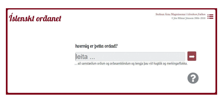
Figure 1: The opening screen of Íslenskt orðanet.

It is impossible to do justice to such a voluminous work in a short review, but let me start by showing the opening screen of the website.