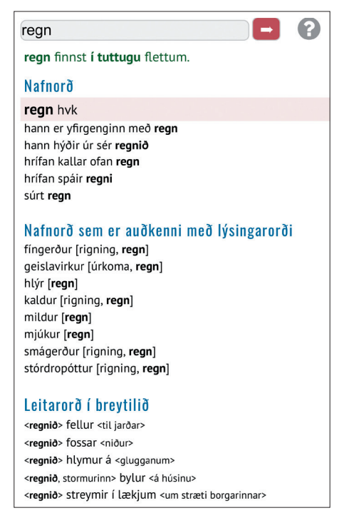
Figure 3: The search window.

When a word is entered into the search box, the word itself appears below (provided it is a headword in the database) followed by a list of phrases containing it. This list can contain from zero to several hundred phrases (for instance, 1585 for the verb gera 'do', 481 for the adjective góður 'good' and 365 for the noun barn 'child').